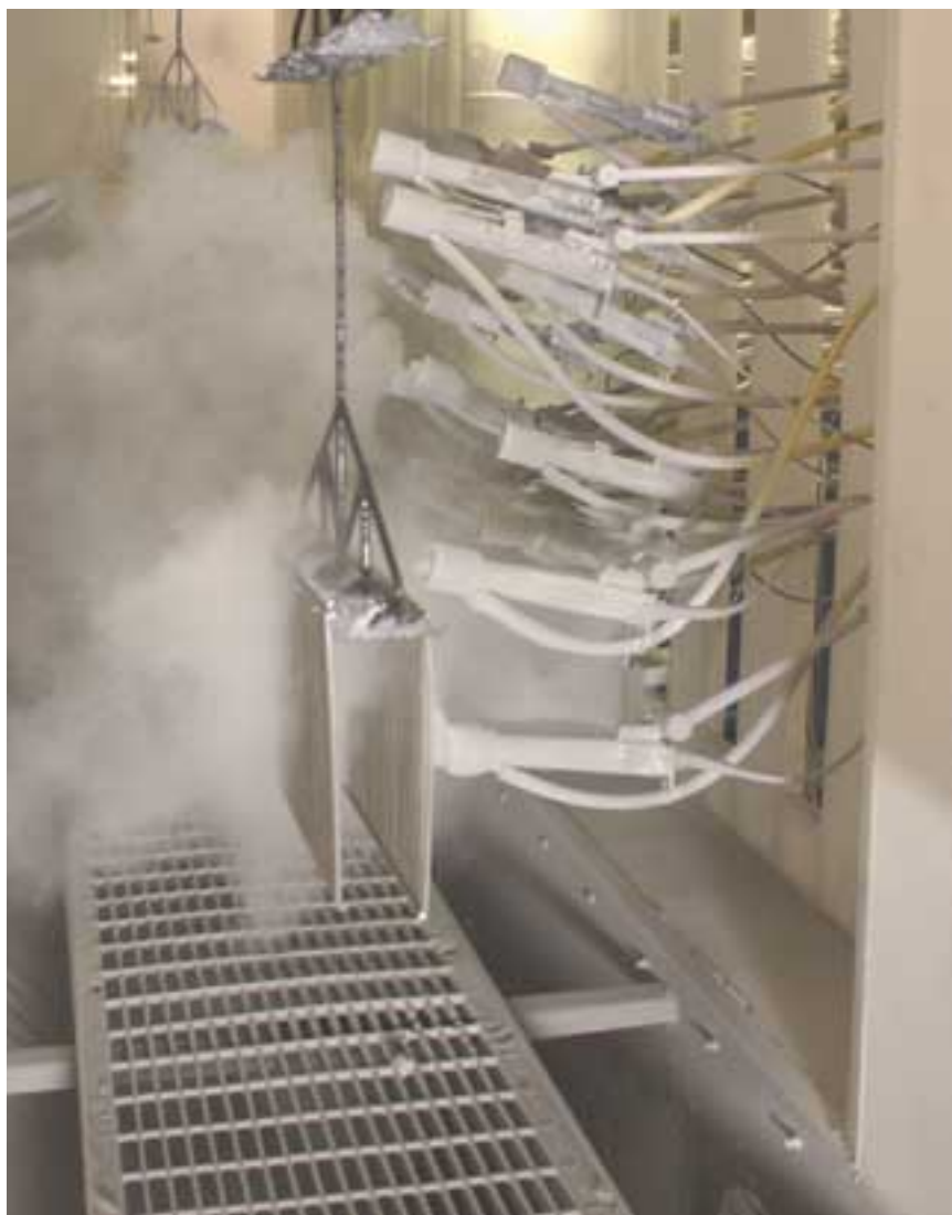
"Smart Cart" cooking grids are powder coated in black fleck powder porcelain at Sunbeam's Neosho, MO, U.S. plant. The company coats more than 1,800 grids per hr.

S unbeam's Neosho, MO, U.S. facility is dedicated exclusively to producing gas and charcoal grills for the consumer market. The facility also holds another distinction: it reportedly operates one of the largest powder coating operations of any end-user OEM in the U.S.