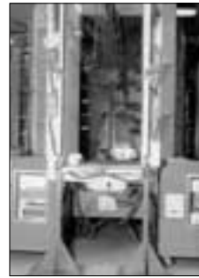
The performance of this powder coating booth at Sunbeam's Neosho facility was reportedly made more cost effective through the use of Chemco's dual-dimpled technology.

also reportedly minimizes the retention of powder between the pleats of the cartridge and powder loss during change-out. In a controlled test comparison involving paper cartridges and dimpled polyester cartridges over an operating period of 2 years, the paper cartridges required four changes and produced a powder loss totaling 1,200 lb. The polyester cartridges required one change and produced a powder loss of 144 lb.